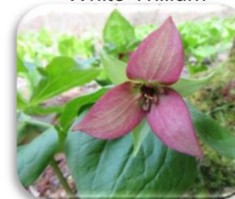
Red Trillium- pink form