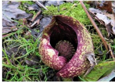
Skunk Cabbage flower