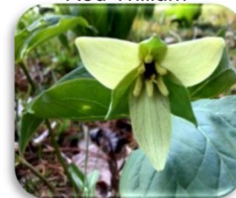
Red Trillium- yellow form