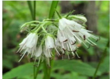
White Virginia Waterleaf