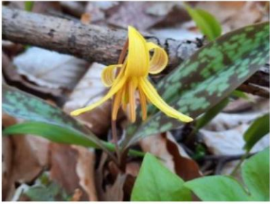
Trout Lily or Dogtooth Violet