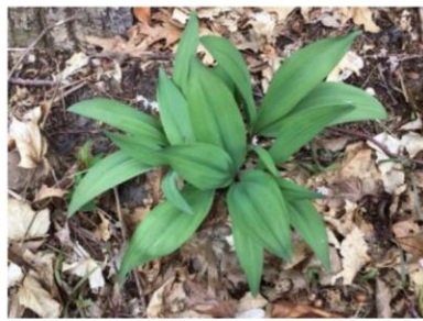
Wild Leek or Ramp