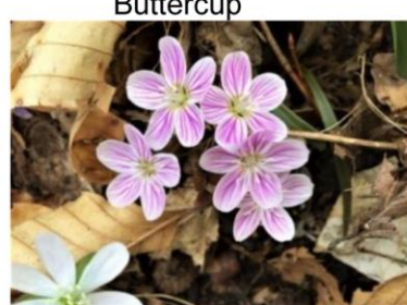
Virginia Spring Beauty