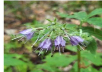
Purple Virginia Waterleaf