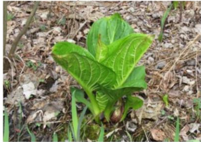
Skunk Cabbage leaves