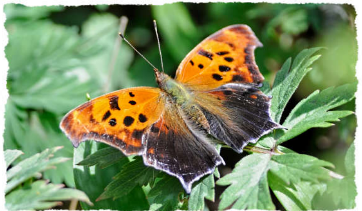
Question Mark 45-68 mm