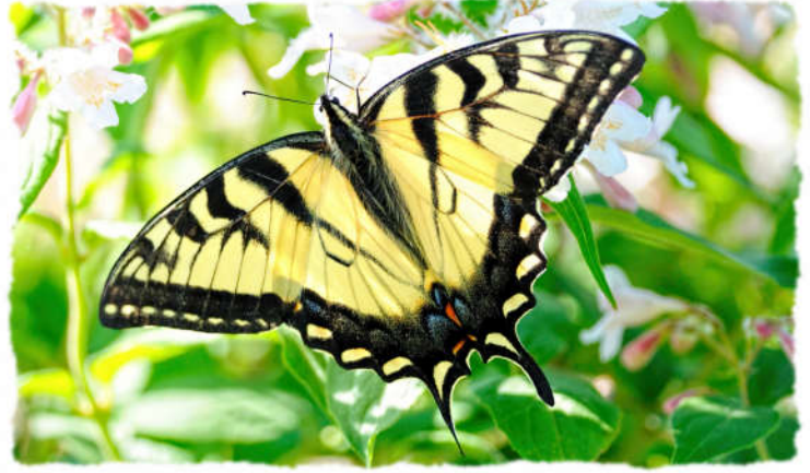
Eastern Tiger Swallowtail 75-100 mm