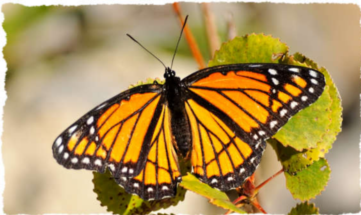
Viceroy 53-81 mm