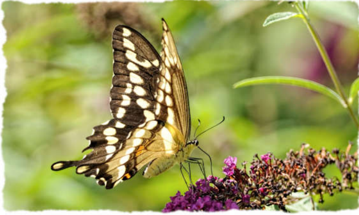
Giant Swallowtail 83-113 mm