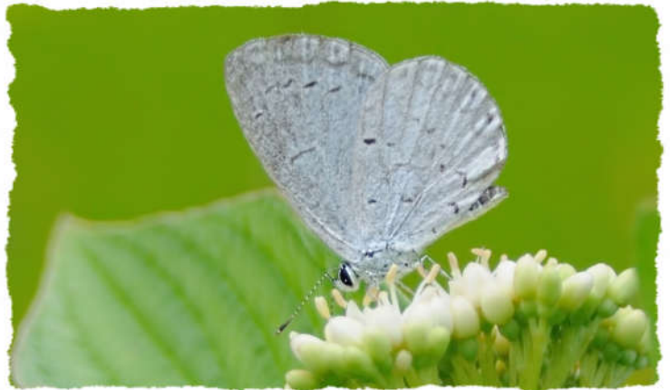
Summer Azure 23-29 mm