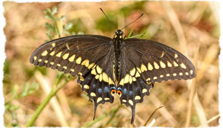
Black Swallowtail 52-94 mm