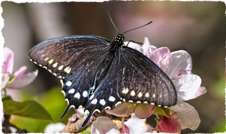
Spicebush Swallowtail 70-90 mm