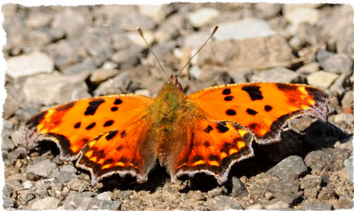
Eastern Comma 37-56 mm