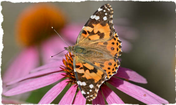
Painted Lady 42-66 mm