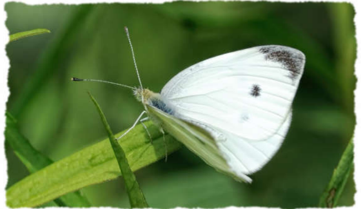
Cabbage White 32-47 mm