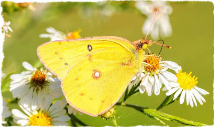
Clouded Sulfur 32-54 mm