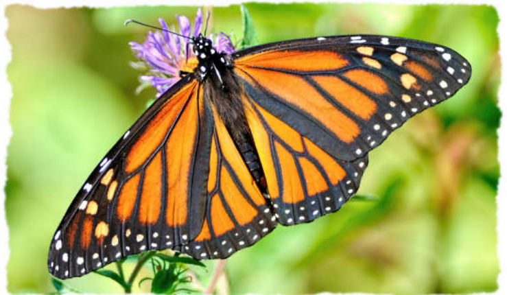
Monarch 93-105 mm

Start watching for butterflies in your own backyard, in a park or greenspace, or along the side of a quiet rural road. Find wildflowers and you should find butterflies. Approach a butterfly quietly and carefully. Avoid casting a shadow across the insect. Do not try to handle it. Watch from a respectful distance, which is best done with binoculars. Zoom in with your camera as it feeds on a flower or rests on the ground. Learn more about individual species using the internet or a butterfly guide available from your local library or bookstore. Butterflies are considered by many to be among nature's crown jewels. . . . Enjoy the show!