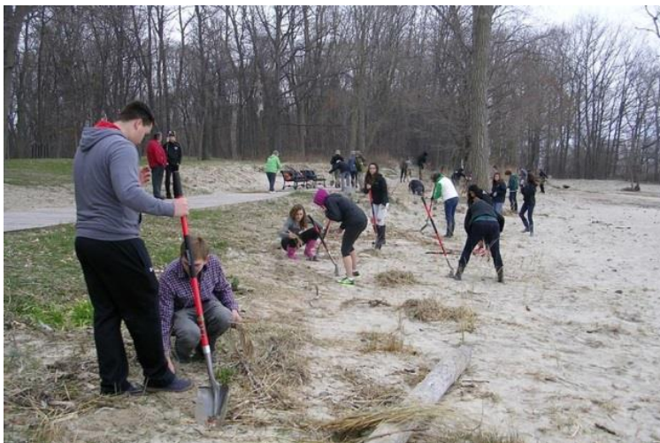
Beach Grass Planting