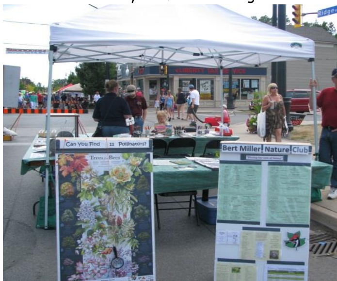
Festivals and Displays