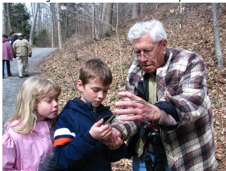
Nature Walk at Marcy's Woods- See the snake.