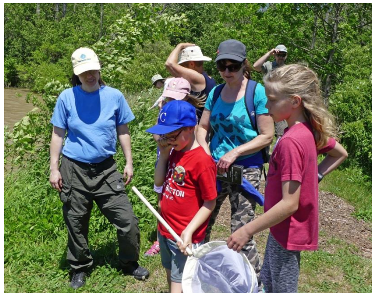
Looking for butterflies at the Butterfly Festival