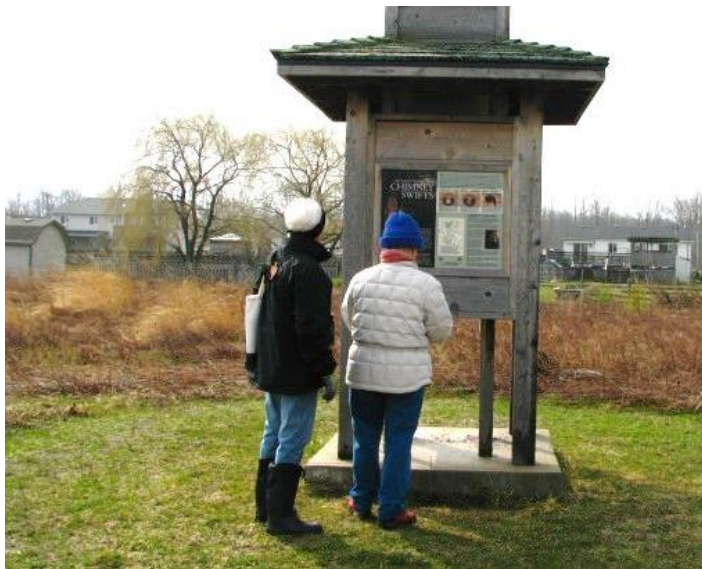
Chimney Swift Monitoring