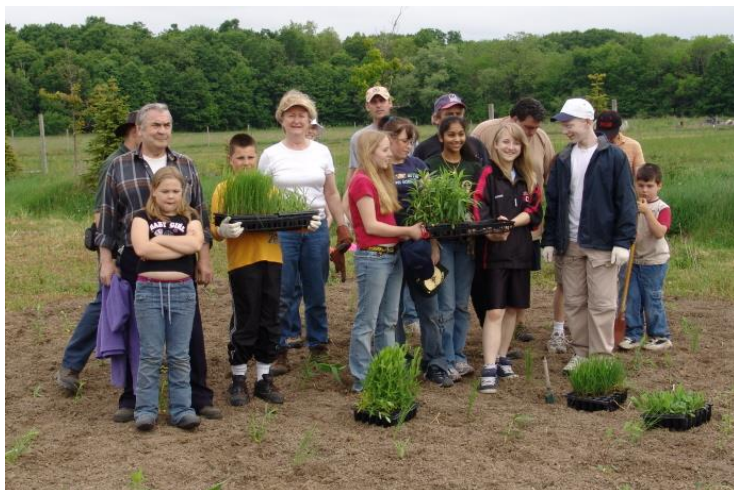
Junior Naturalists planting at Shagbark Nature Park